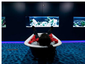
THE OFFICE, PEOPLE AND PROJECTS

This guide is intended to add clarity to the role & responsibilities of a software engineer at Google. It will also give a clear overview of the recruitment process and help you best prepare for your upcoming interviews with Google. If you have any questions, please don't hesitate to get in touch.