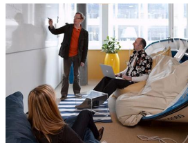
PREPARING FOR YOUR INTERVIEW + Technical Prep + Interview Tips