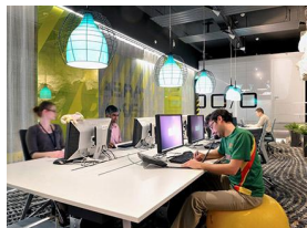
THE ROLES AND RESPONSIBILITIES